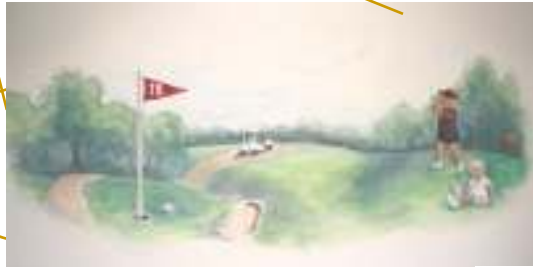
(3 x 8 ft.)