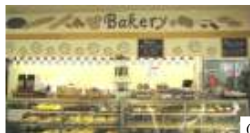
(1 x 10 ft.)