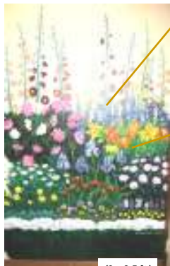
(6 x 3.5 ft.)