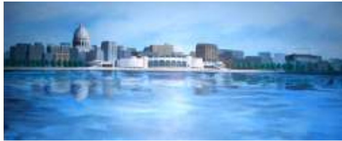
(5 x 14 ft.) Formerly in South Towne Sentry Foods, this mural may be available for purchase.

Restaurants & cafes, offices, churches, grocery stores, libraries, health clubs, hospitals, malls, daycares & more.