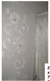
2 x 7 ft.

Simply elegant: A free-flowing enlargement of the shower curtain's pattern.